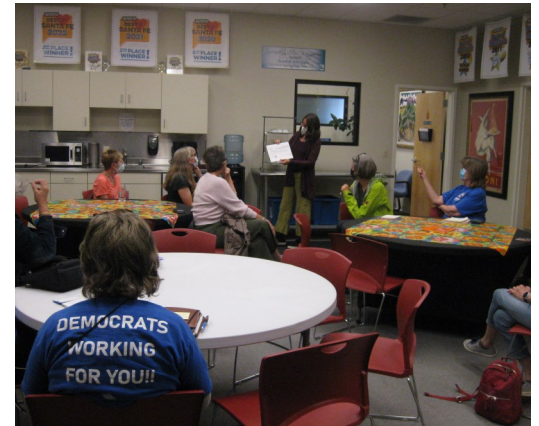
Above—CSP Volunteers attending class/break room training in preparation for meal delivery.

Kitchen Angel’s mission is to provide free, nutritious meals to homebound community members facing life-challenging conditions. On August 10, 2022, eleven CSP volunteers attended a training at Kitchen Angels in preparation for Wednesday Route 1 meal delivery. The Wednesday Kitchen Angels team consists of five sub-teams that rotate. There are also sub-