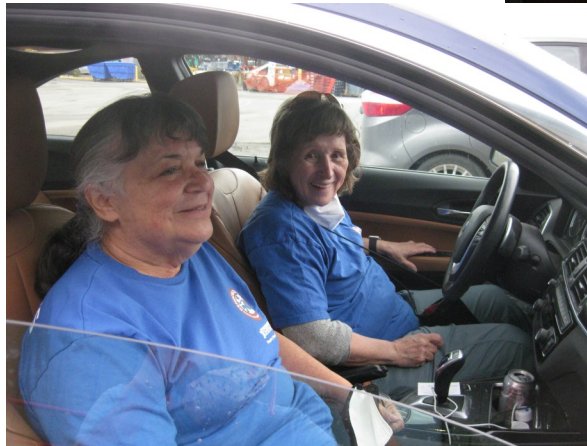
Left—CSP Volunteers set out on the inaugural meal delivery as Team 1, Route 1 Wednesday delivery.